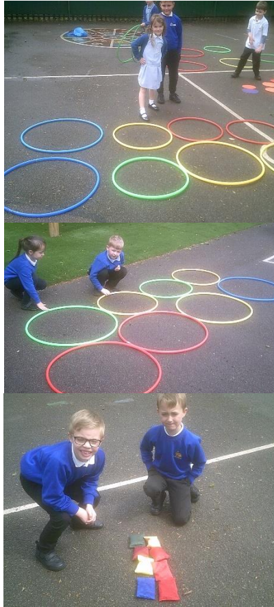
“Our Array has 2 rows and 3 columns,” Archie.