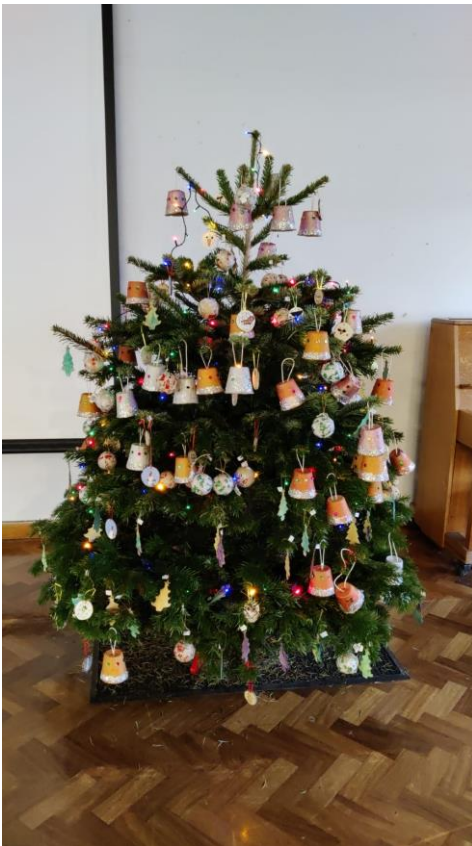
Children made decorations in class last week and hung them on the Christmas tree in the school hall.