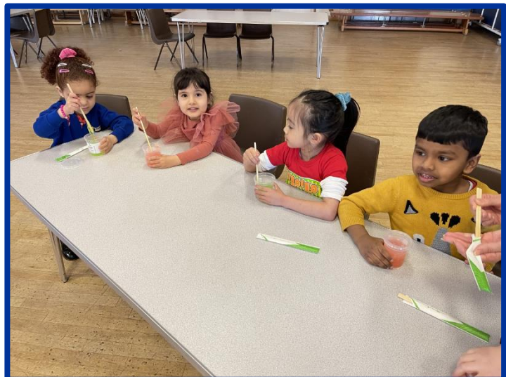
Chestnut Class enjoyed getting their hands messy making their slime.