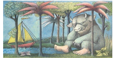
STORY AND PICTURES BY MAURICE SENDAK